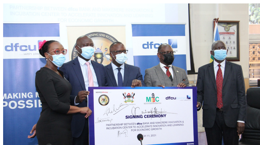
Partnerships that drive innovation: Signed a strategic partnership with Makerere University and the Ministry of Finance, Planning & Economic Development to create a platform to support young entrepreneurs advance ideas on innovative solutions for enterprises that create socio-economic impact.