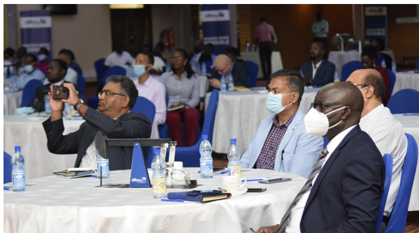
Possibilities in the Oil & Gas Sector: Held an engagement for key players to support local content participation.